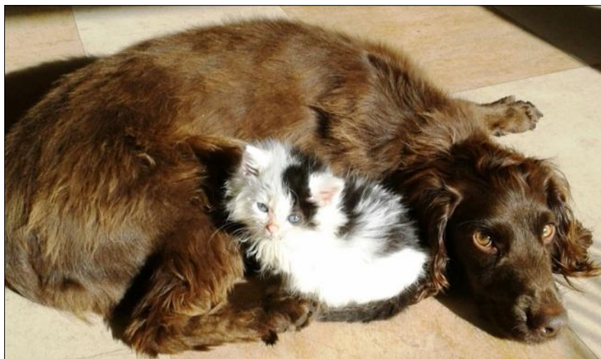
Surrogate mum Scout with Tommy, 'Chelford mini-kit' see story page 6

Of the animals profiled in the last edition (available on the website www.windyway.org ) only three have been rehomed; Coco, who got his wish to live in the country as an only cat, and Connie and Raisin our FeLV cats who were rehomed together. All are very happy in their new homes. Just one pair of rabbits has been rehomed since the summer and we still have five pairs waiting here as well as Suzie and Arnie the dogs who were featured. So many of our dogs (and cats) are getting on in years and too many people are put off by age. It is sad for us to be caring for these animals in kennels—no matter how cosy and comfortable we make them it cannot compare with living out their retirement years in the luxury of individual caring homes. If you have the emotional strength to give an oldie some 'one to one' love and affection in their final months or years then please do think about it and maybe pay us a visit.