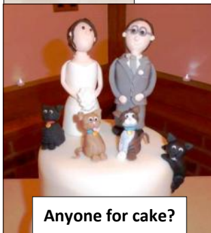
Anyone for cake?