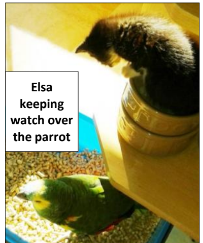
Elsa keeping watch over the parrot